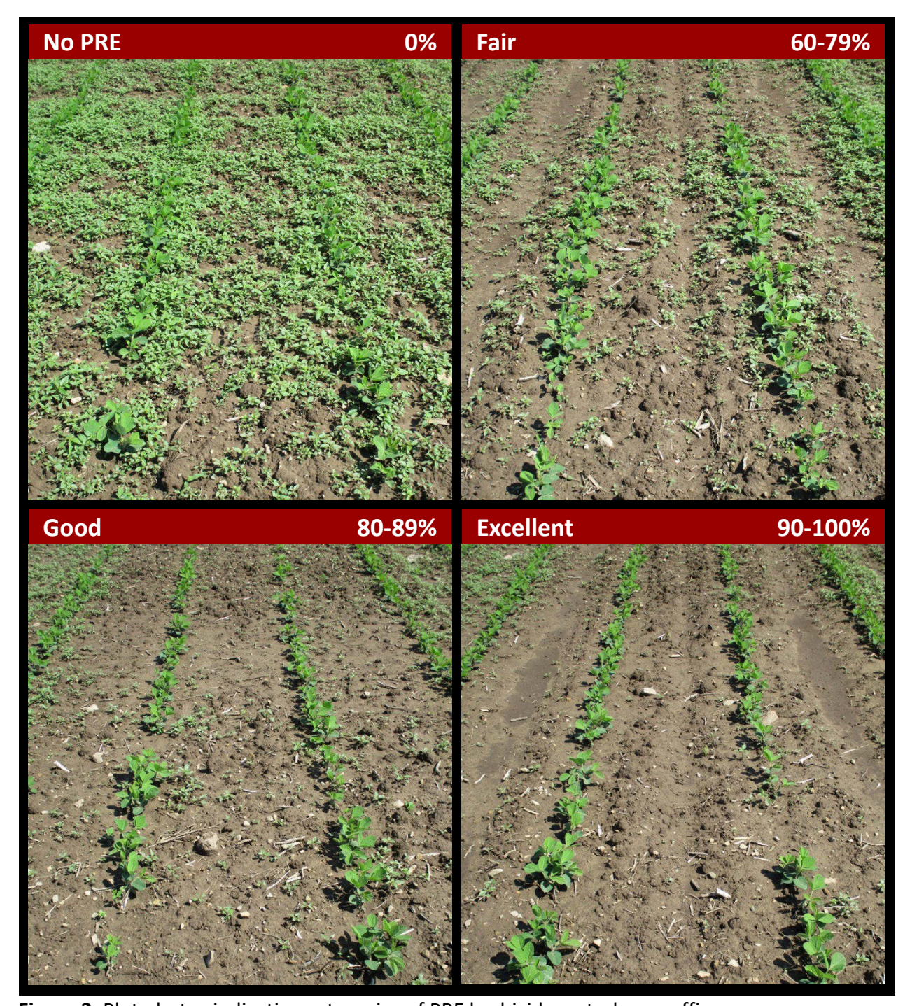
Figure 3 . Plot photos indicating categories of PRE herbicide waterhemp efficacy.